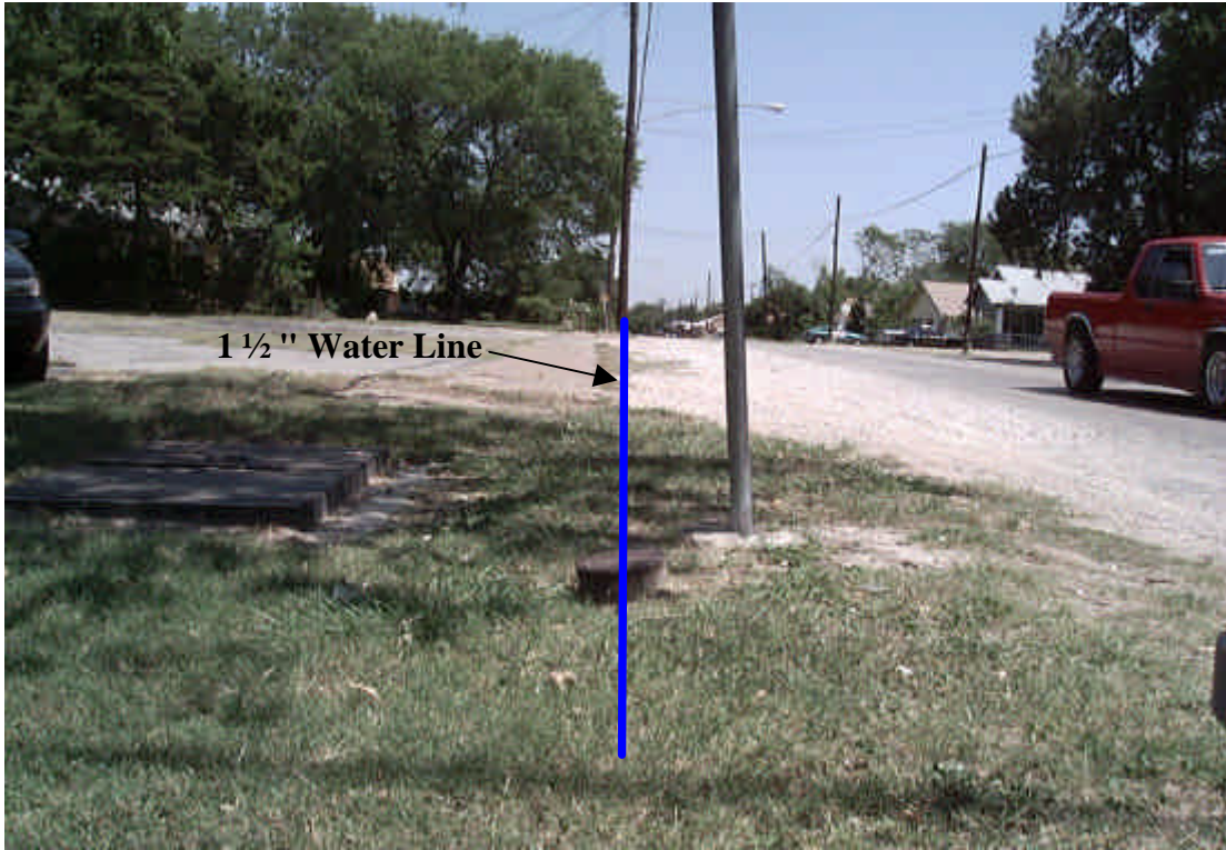
Figure 1 – Looking north at Ewing Avenue from Winters Street.