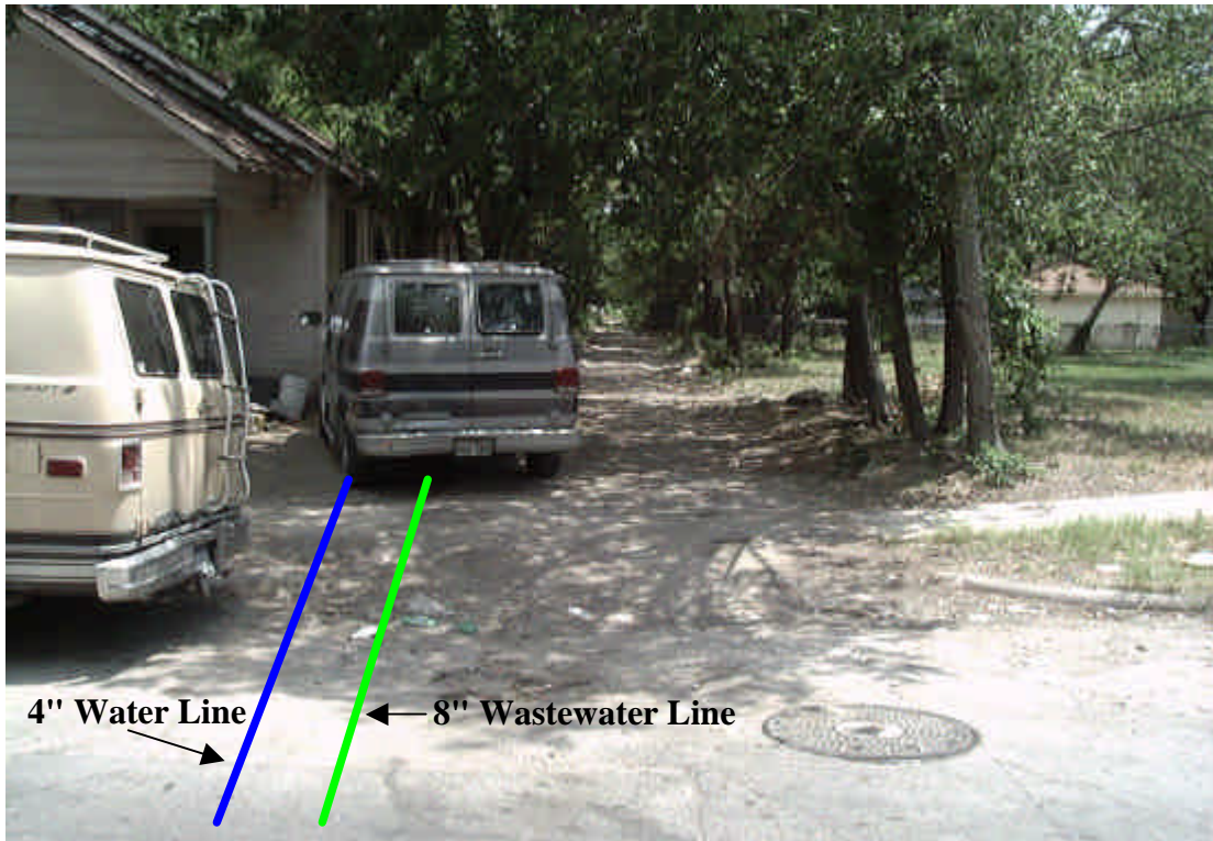
Figure 1 – Looking northeast at the wastewater and Southwestern Bell manholes from Crawford Street down the alley between Ninth Street and Tenth Street.