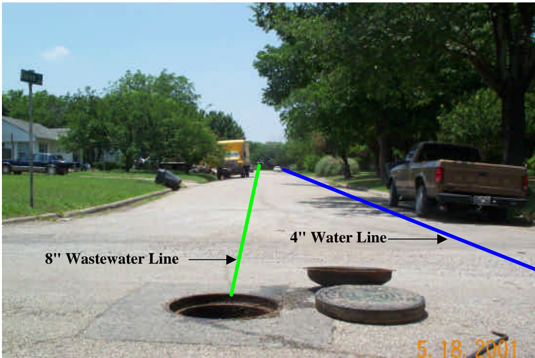
Figure 3 – Looking west from Warrington Drive at wastewater manhole down Elaine Drive.