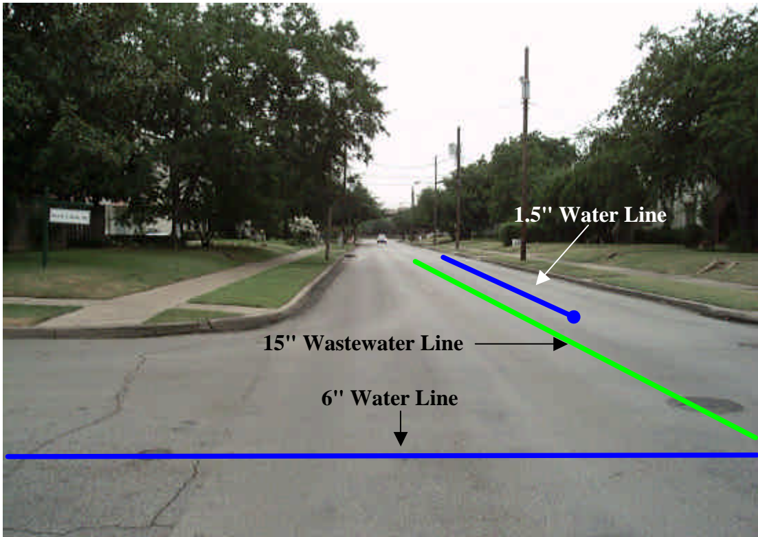
Figure 1 – Looking east at Douglas Avenue from Rawlins Ave.