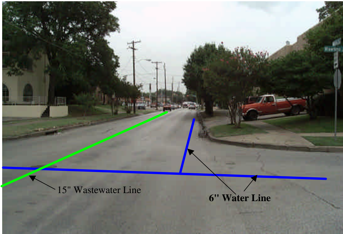
Figure 2 – Looking west at Douglas Avenue from Rawlins Ave.