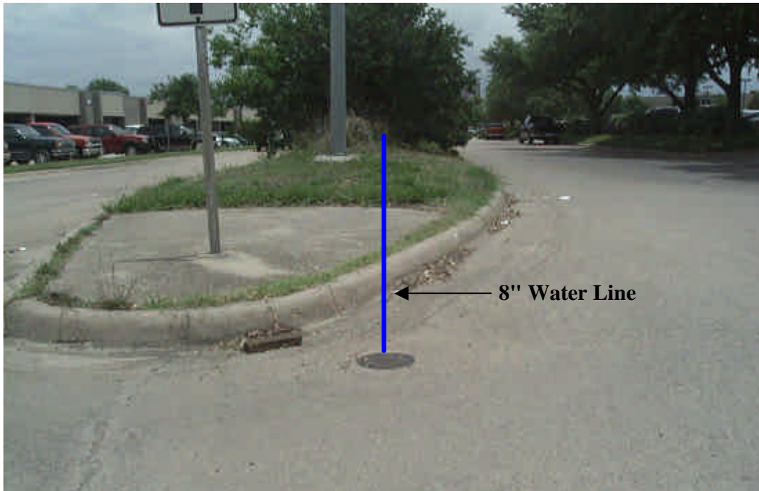
Figure 1 – Looking southeast at water valve from Empire Central Drive down Empire Central Place.