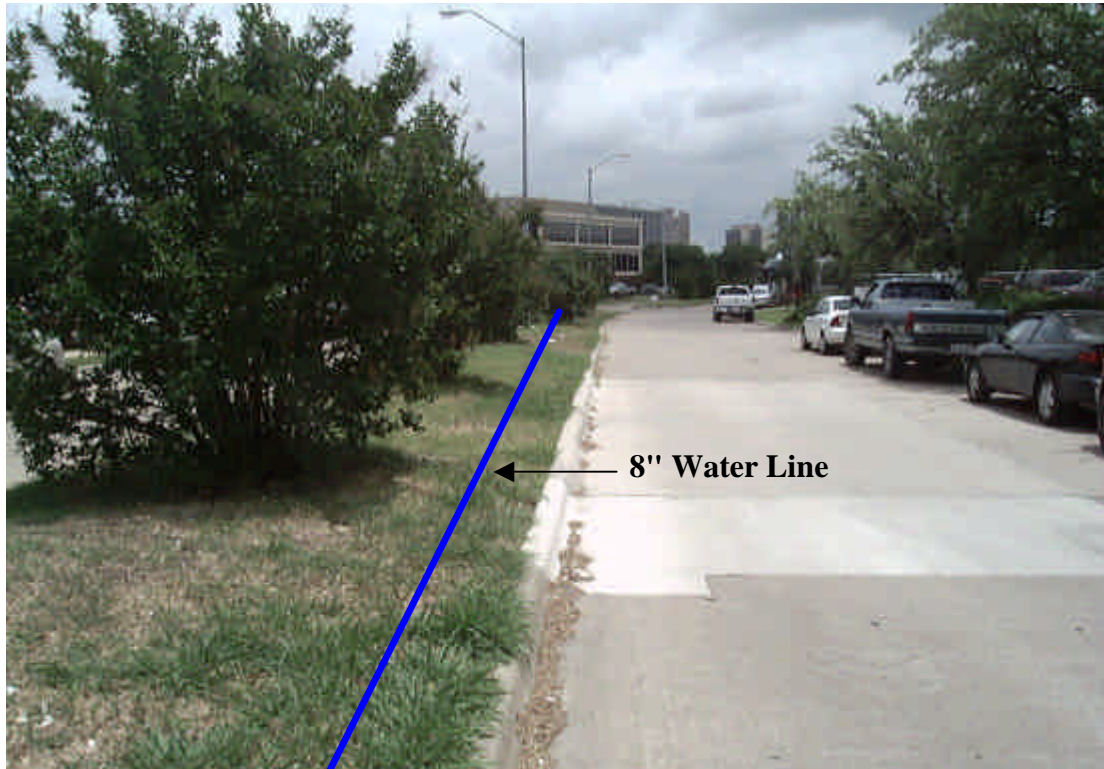
Figure 2 – looking southeast down Empire Central Place ? 200 ft from Empire Central Drive.