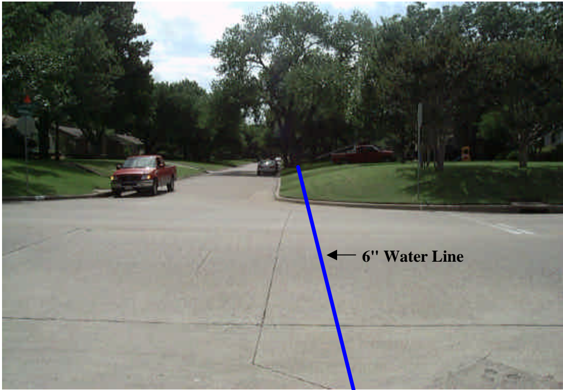
Figure 1 – Looking west from Devonshire Drive down Greenbrier Drive.