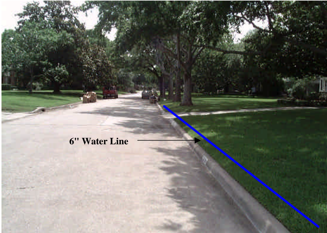
Figure 3 – Looking west at large trees down Greenbrier Drive.