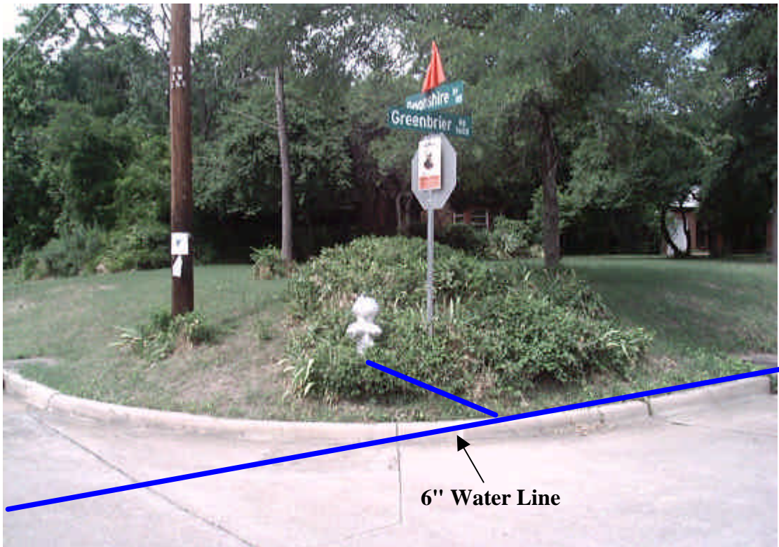
Figure 2 – Looking northeast at hydrant on northeast corner of Devonshire Drive and Greenbrier Drive.