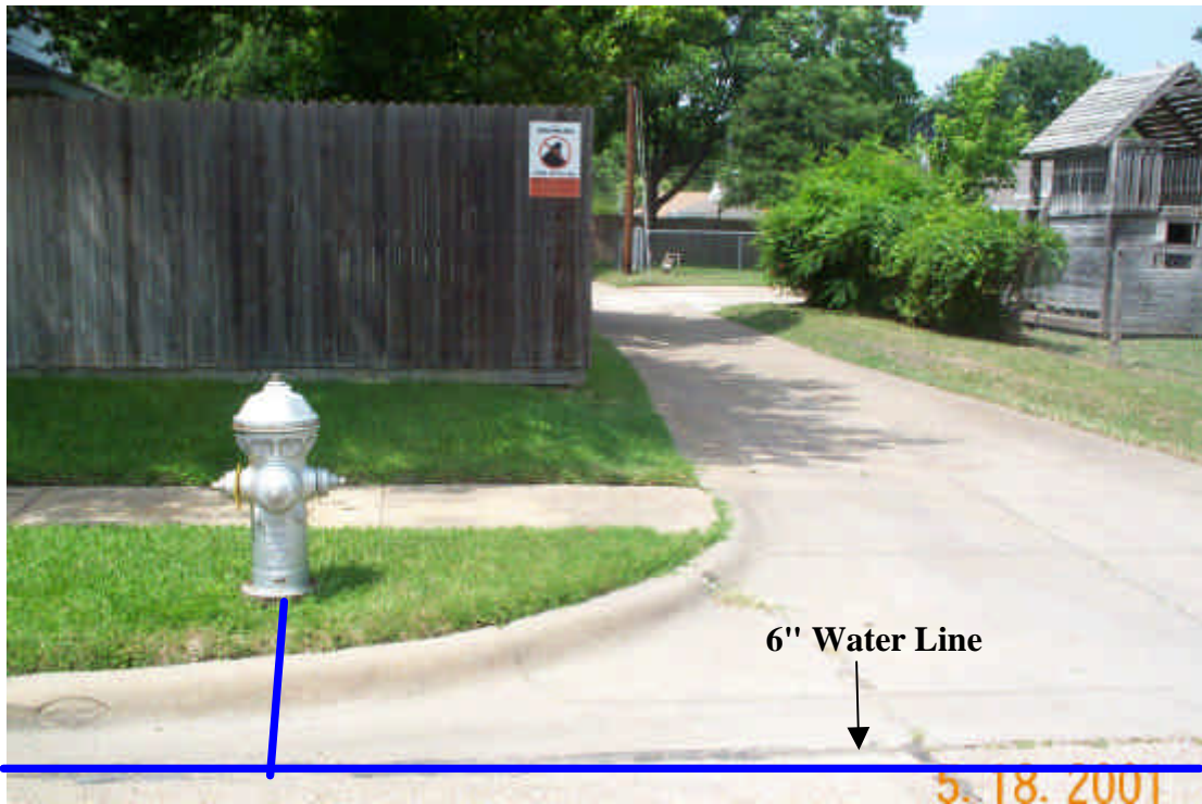
Figure 3 – Looking north at hydrant from Lanward Circle.