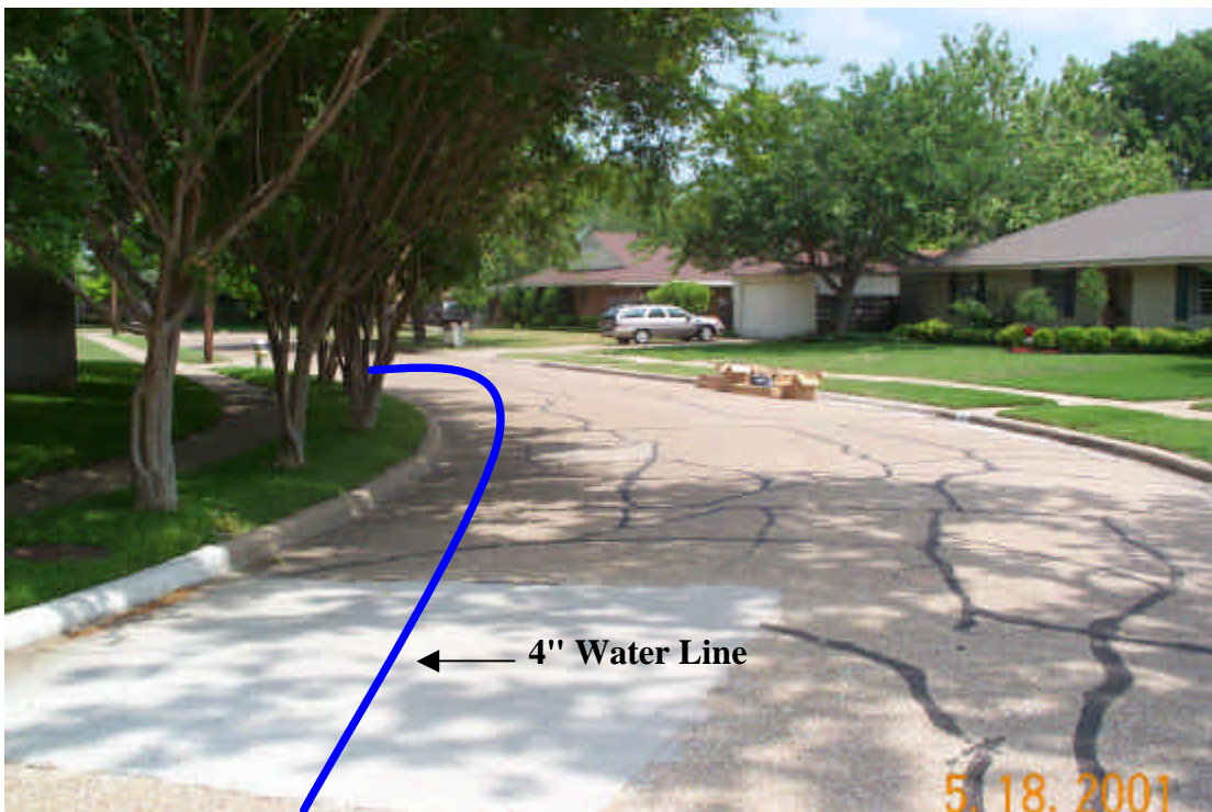
Figure 2 – Looking southeast down Lanward Circle.