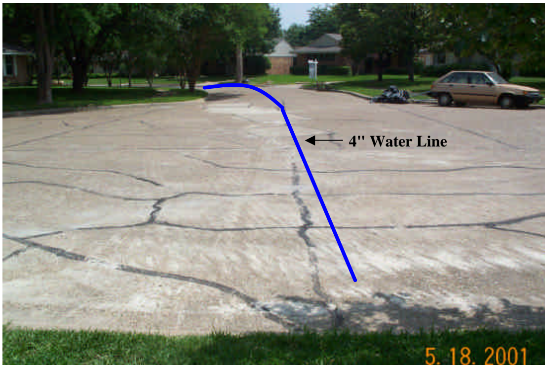
Figure 1 - Looking south down Lanward Circle from Lot 8.