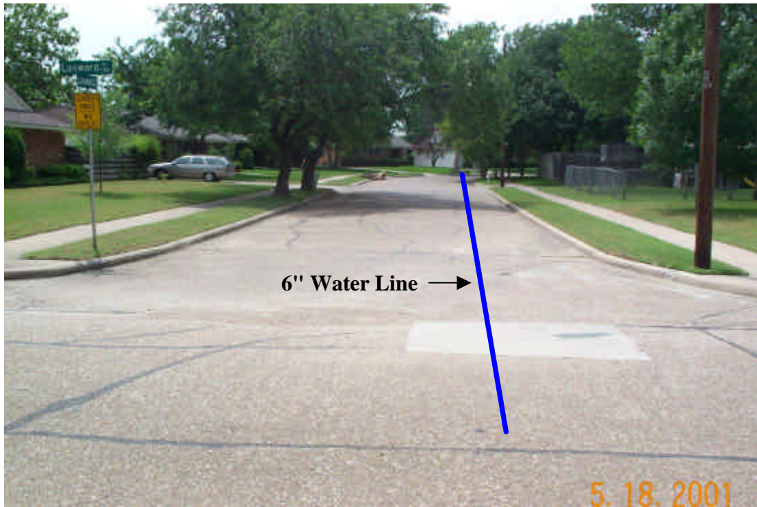
Figure 5 – Looking west from Lanward Drive down Lanward Circle.