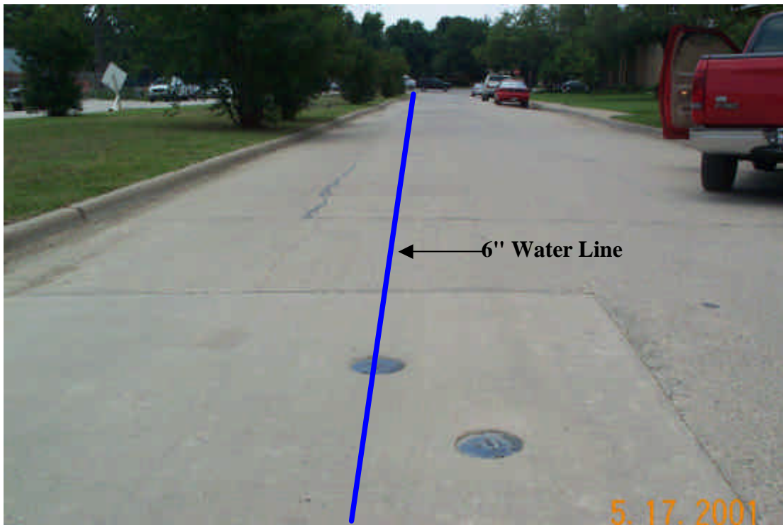
Figure 9 – Looking south at new valves across from building construction site down Edgemere Road.