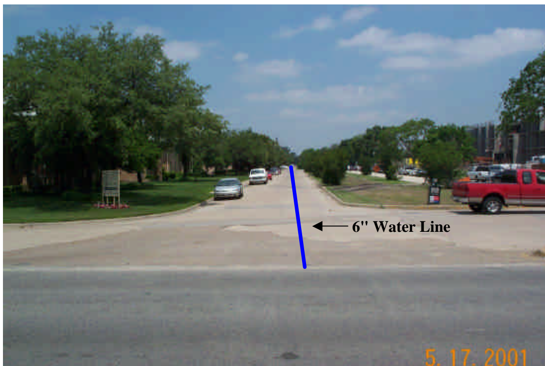
Figure 10 – Looking north from Northwest Highway down Edgemere Road.