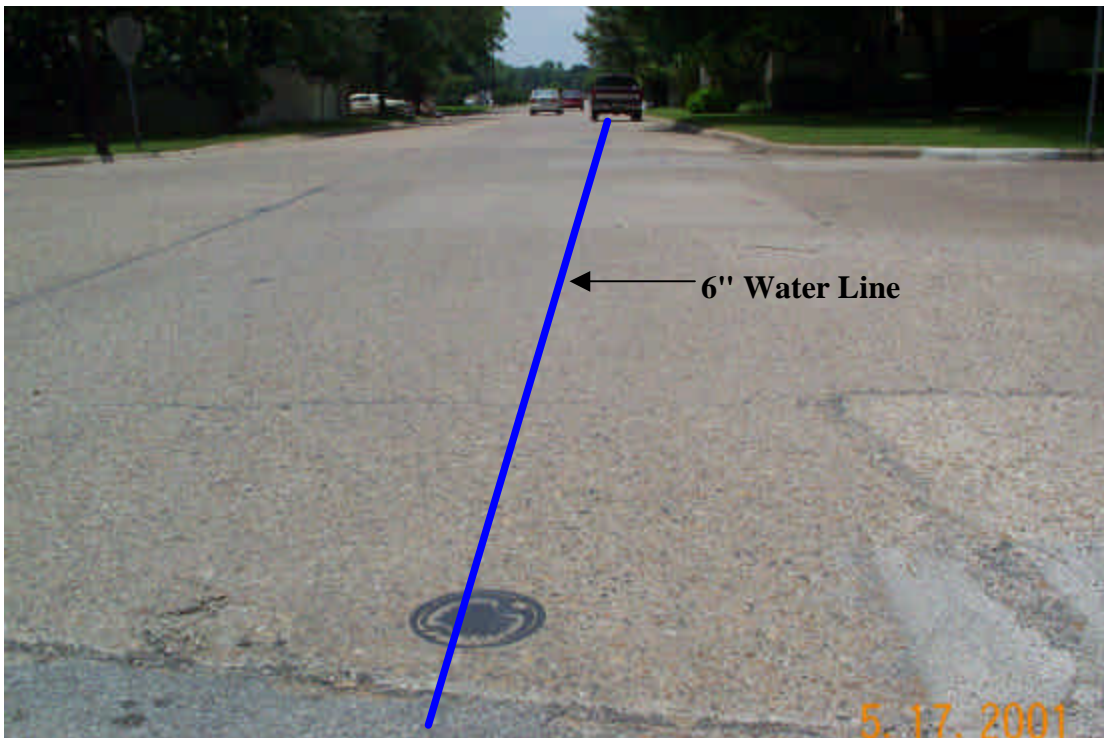
Figure 4 – Looking south at valve near intersection of Deloach and Edgemere Road down Edgemere Road.