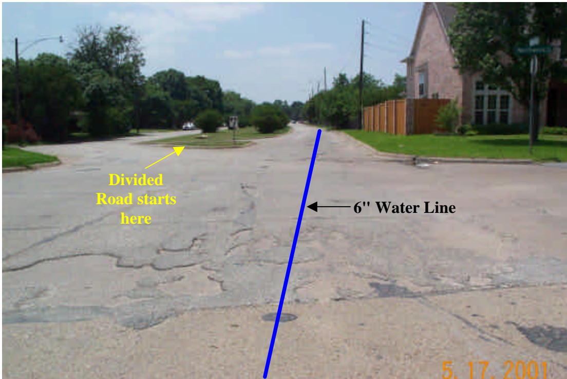
Figure 5 – Looking south at valve near intersection of Northwood Road and Edgemere Road down Edgemere Road.