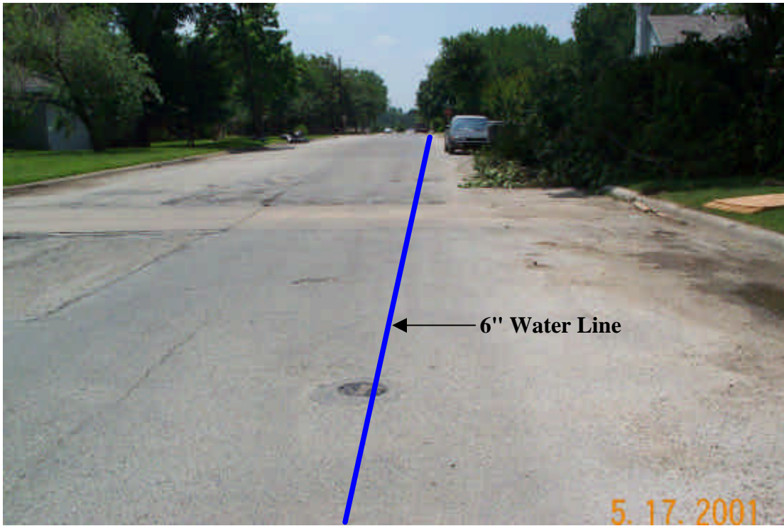
Figure 3 – Looking south at valve near intersection of Chevy Chase Avenue and Edgemere Road down Edgemere Road.