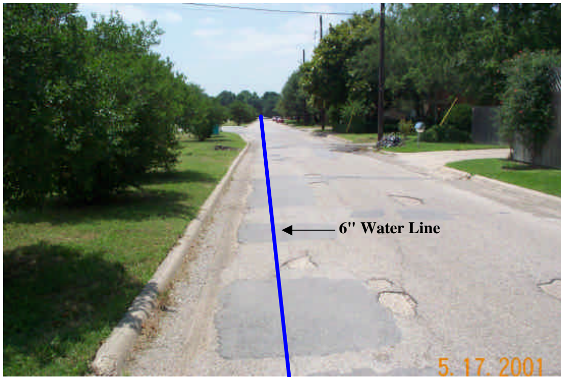
Figure 7 – Looking south at unlocated valve location down Edgemere Road.