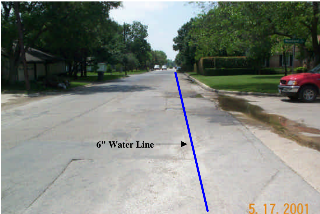
Figure 2 – Looking south at intersection of Woodland Drive and Edgemere Road down Edgemere Road.