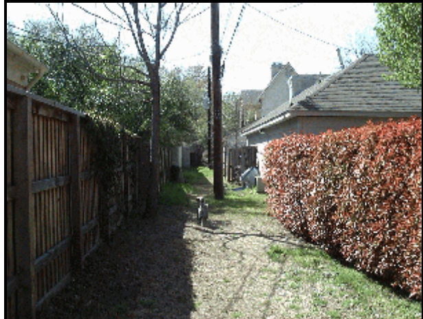
Figure 8 - Completed project - water and sewer replaced in easements with minimal disruption to citizens

After a “good” lab report was received, the new main was connected to the existing water main, and services changed over from the temporary water line. Access pits and service tie locations were covered, and the easement graded and sodded. The entire installation was completed in fifteen working days, exclusive of lab testing. Noise from the bursting equipment lasted for only four hours, as compared to a similar open cut project where over five weeks of equipment movement took place within the easement. Not only was noise pollution reduced, but there was no trench spoil to store, and no embedment to truck into the easement. The result; minimal citizen complaints during the construction period -- a welcome outcome on any project. The cost to the Town of Highland Park for clearing the easements, installing the new main with all appurtenances, grading and sodding was $103 per foot. This represented a savings of nearly 30 percent over previous open cut replacement in a similar area.