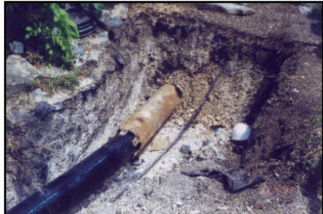
Figure 7 - Insertion pits were approximately 10' x 6'

New service connections were made at each meter location using a full circle brass service saddle. Tees for fire hydrants were ductile iron, restrained with Mega-lug joint restraints. HDPE pipe manufactures now have saddles and fittings available that can be fuse welded to the pipe. Once the service connections were in place, the new line was cleaned and tested.