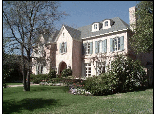
Figure 1- Average value of homes in Highland Park exceed $500,000

The Town of Highland Park, Texas, occupies an area of approximately two and one-half square miles, encircled by the City of Dallas. The small, influential community first experienced development around 1900, and was mostly developed by 1940. In the oldest areas, the portion of the Town's water distribution system that services its residential customers is generally cast iron, and lies within narrow easements. The easements have had a 75-year opportunity for vegetation, trees, fences and other structures to encroach; in some cases restricting working space to less than 8-feet. Due to numerous water line breaks, exacerbated by an increased water demand from new large homes constructed to replace the original 1925 cottages, the Town is faced with replacing these water lines.