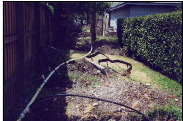
Figure 5 - Temporary water lines could meander within easements

Since the water mains to be replaced were the only source of water for the residents, temporary water mains were installed prior to beginning