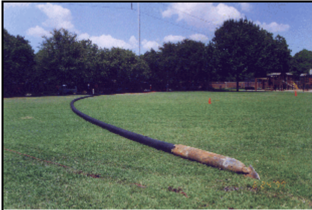
Figure 6 - Town park was available for equipment staging

replacement. Certainteed “Certa-Lok” 2-inch PVC pipe was used for the temporary water lines. Since there would be no large excavating equipment needed in the easements, the temporary water lines could