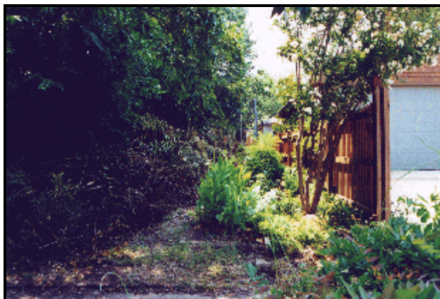
Figure 2 - Easements in the project location were overgrown and congested with utilities

In 1997, The Town completed a Sewer System Evaluation Study (SSES) on the eastside wastewater collection system. Recommended improvements from the study were incorporated into a five-year rehabilitation program. A portion of the planned sewer line replacements is located within the same easements that the water lines occupy. The need to replace the water lines due to condition, as well as to increase the size from 6-inches to 8-inches, was addressed by inclusion of the water main replacements with the sewer replacement projects.